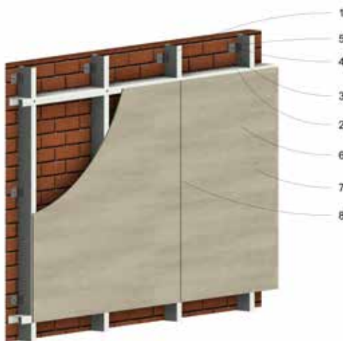
Wall Lining plank overlap on wall

*With MP Board substrate wherever required.